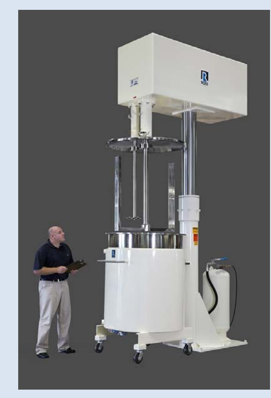
Ross Dual-Shaft Mixer Model CDA-200