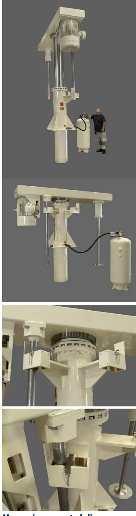
Mezzanine-mounted disperser with two-position swivel system koss white Paper: Solutions to Batch Mixing Issues

As batch volumes become larger, maintaining the recommended design parameters become more challenging. Because blade diameter is essentially determined by the vessel size, very large high speed dispersers eventually require horsepowers that are impractical.