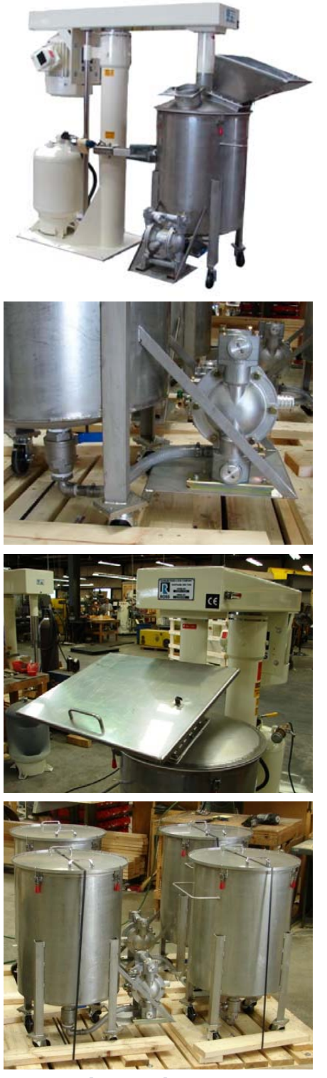
Ross High Speed Disperser with Custom 50-gallon Tanks