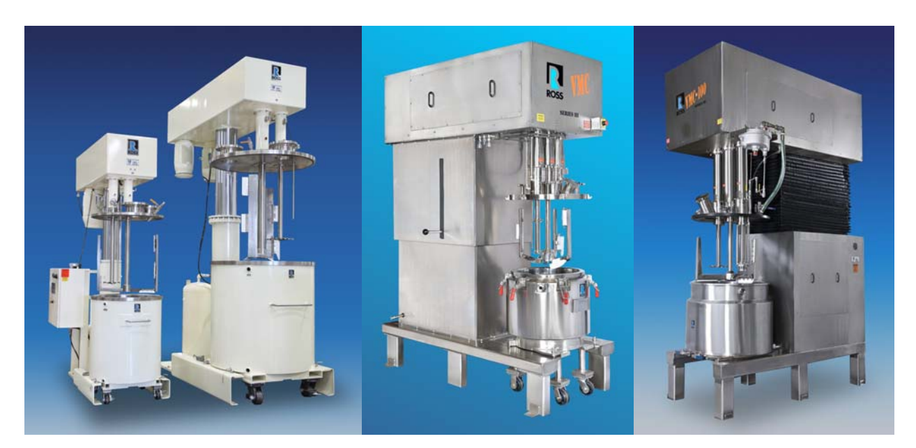
Different configurations of Ross Multi-Shaft Mixers.

Sample applications of Multi-Shaft Mixers include pureed foods, sauces and syrups, hot-melt adhesives, rubber solutions, clay dispersions, cosmetic creams, medical gels, pharmaceutical suspensions, printing inks, specialty coatings, polymer dispersions, conductive pastes, lubricants, metallic and ceramic slurries, etc.