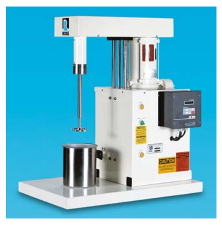
Bench-top High Speed Disperser with air/oil hydraulic lift.