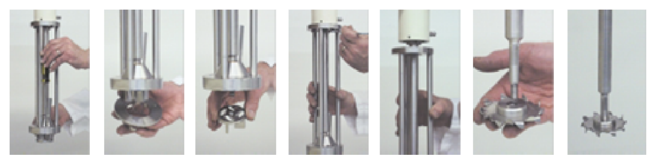
In a Ross laboratory mixer, the batch rotor/stator is designed to be easily swapped with a disperser assembly (and vice versa) without having to adjust or disassemble the pulleys, bearing housing, or shaft.