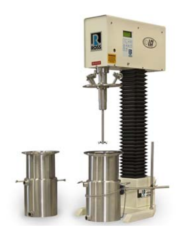
Vacuum-rated High Speed Disperser with custom vessels which clamp to the mixer cover for a vacuum-tight seal.