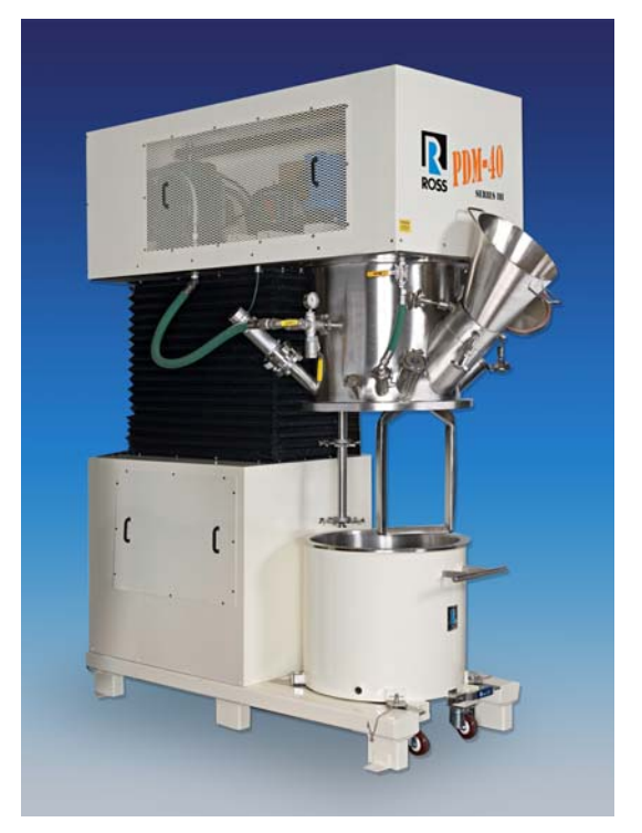
Ross PowerMix (US Patent No. 4,697,929)

The PDDM also offers a unique processing flexibility: the agitators are easily removable, allowing the mixer to be operated as a classic Double Planetary Mixer or as a PowerMix.