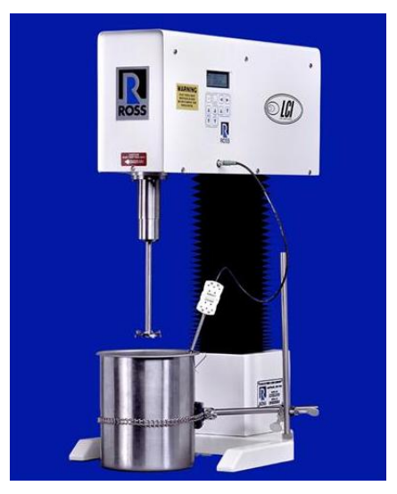
Laboratory High Speed Disperser with electronic push-button lift, shown here with a built-in thermoprobe.

While High Speed Dispersers are generally used for straightforward solid-liquid mixing requirements, rotor/stator mixers are utilized for emulsification, particle size reduction and homogenization purposes. Conventional rotor/stators, also called High Shear Mixers, consist of a four-blade rotor running at tip speeds in the range of 3,000-4,000 ft/min within a close tolerance fixed stator. This type of device imparts intense mechanical and hydraulic shear by continuously drawing product components into the rotor and expelling them radially through openings in the stator.